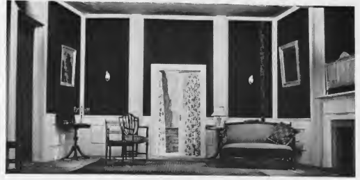
1921— The Circle —Feb., 1938*

Margin For Error —Timeliness helped appreciation by the student audience.